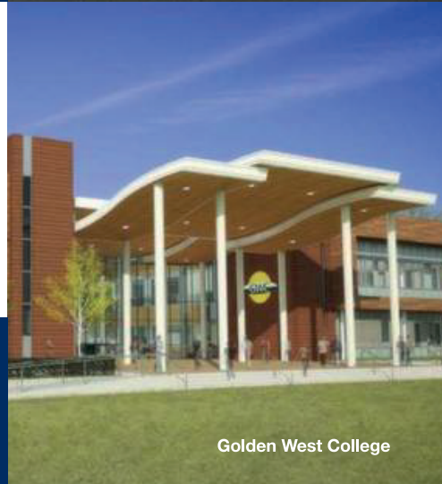
Golden West College

Construction of a new 51,969 square foot building at the center of campus which will house all student services. This project also includes the relocation of the existing main distribution frame (MDF) and other utilities prior to the demolition of the existing Library which has been underutilized since the construction of the new Learning Resource Center (LRC).