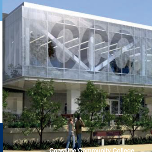
Coastline Community College

Addition of a 2,000 square foot Student Resources Center to provide a student-oriented space promoting student success and extended learning opportunity. This project also includes the renovation of the student lounge, the creation of an entry plaza and a seating and student café.