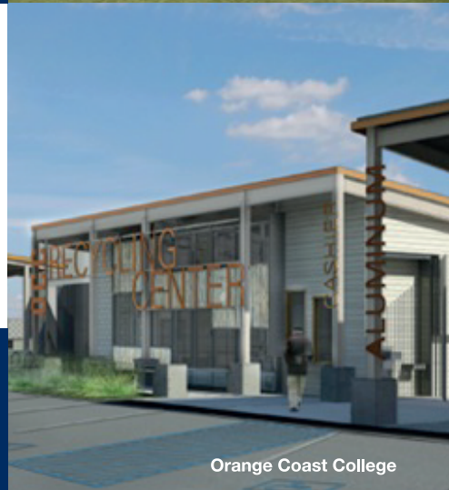
Orange Coast College

Site improvements to enhance accessibility to the center and accommodate additional parking to support logistical objectives. In addition, this project includes a new "Green Classroom Building" that will serve various instructional departments on campus.